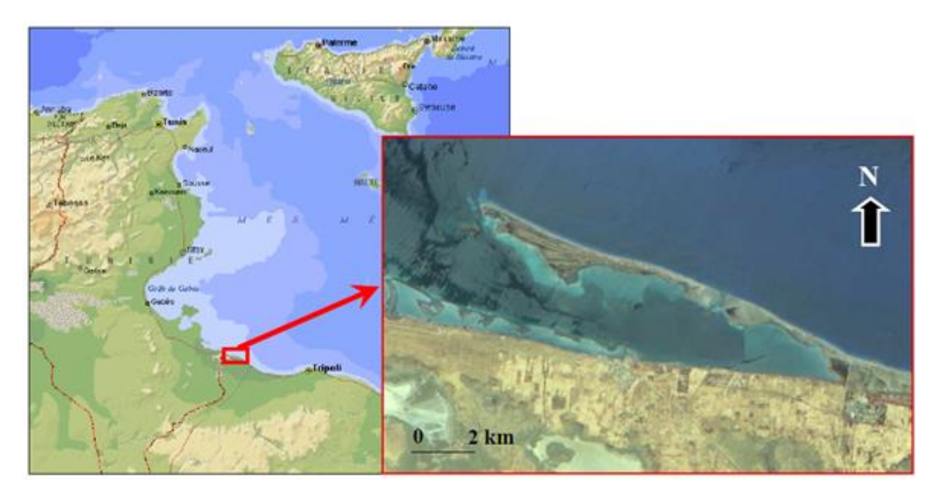
Figure 1. Map of Farwa (Pergent et al. 2002)